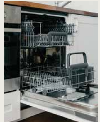
Discounts on new appliances