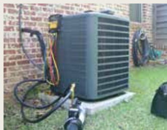
Pre-season HVAC tune ups