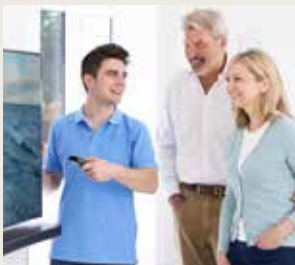
Smart home tech installation and setup services