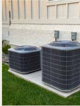
Seller HVAC Option