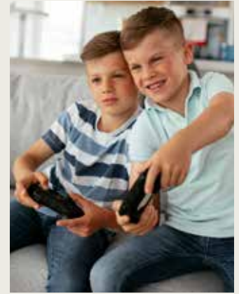
Electronics Protection Plan